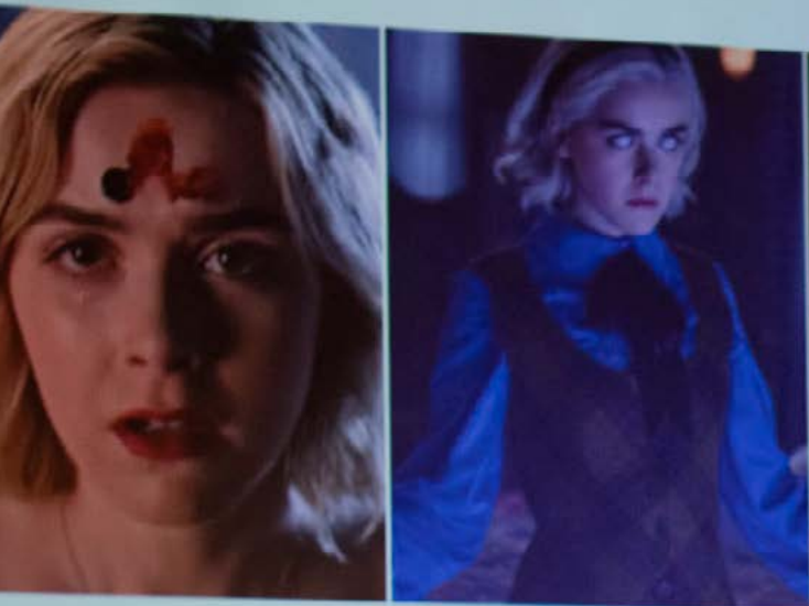
ina Spellman. ing Adventures of Sabrina, 2018-X